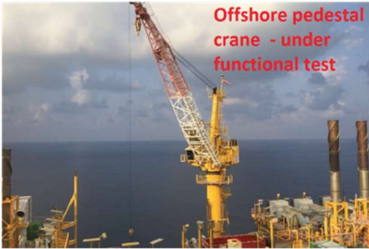
Offshore pedestal crane - under functional test